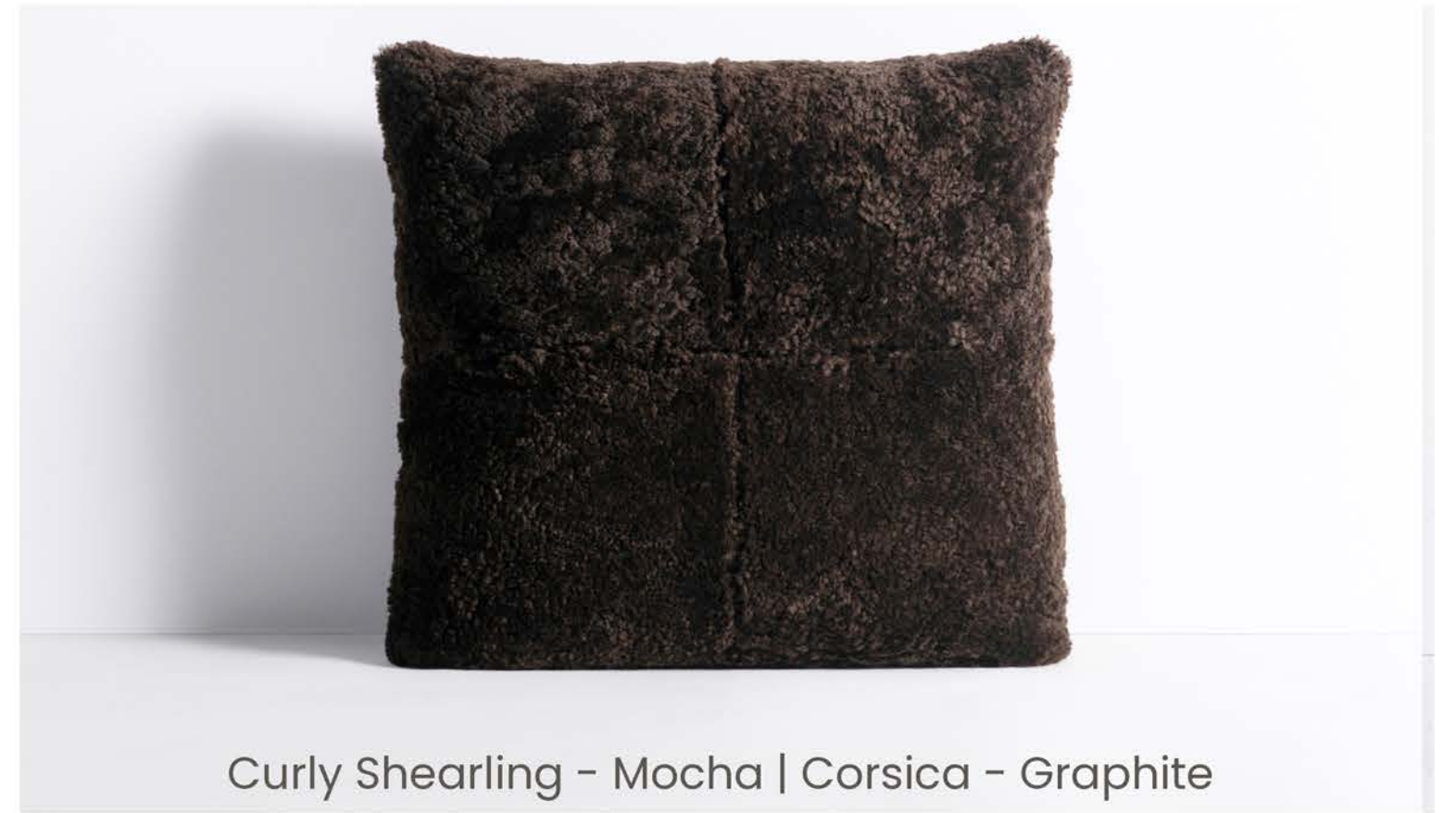
Curly Shearling - Mocha | Corsica - Graphite