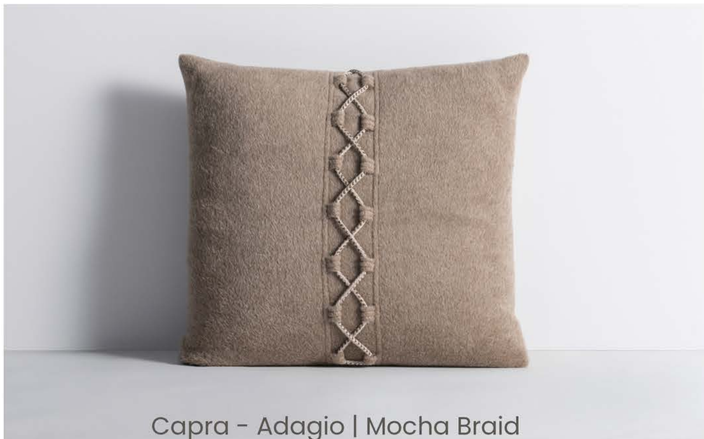
Capra - Adagio | Mocha Braid