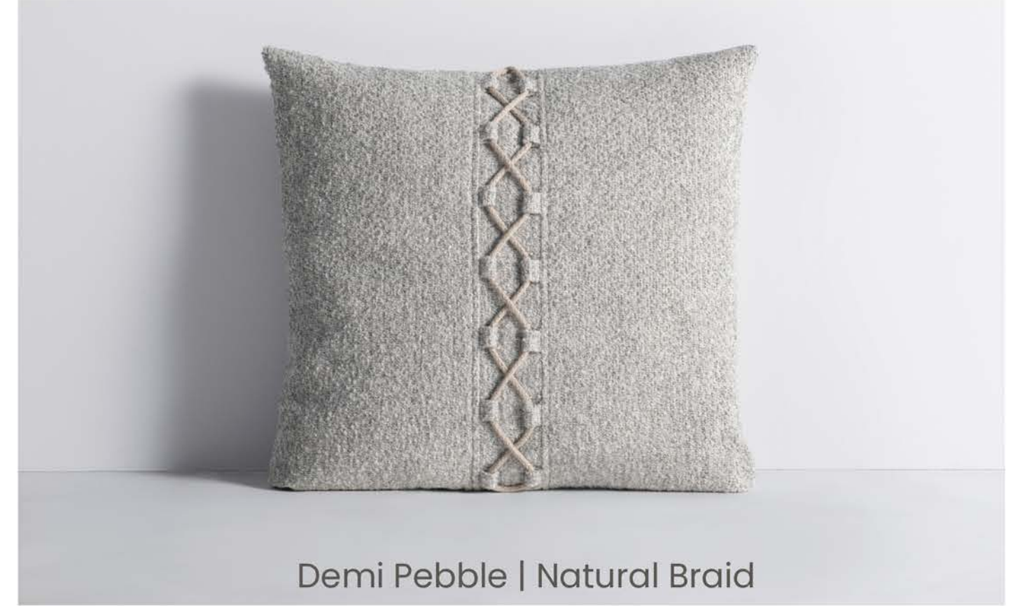
Demi Pebble | Natural Braid