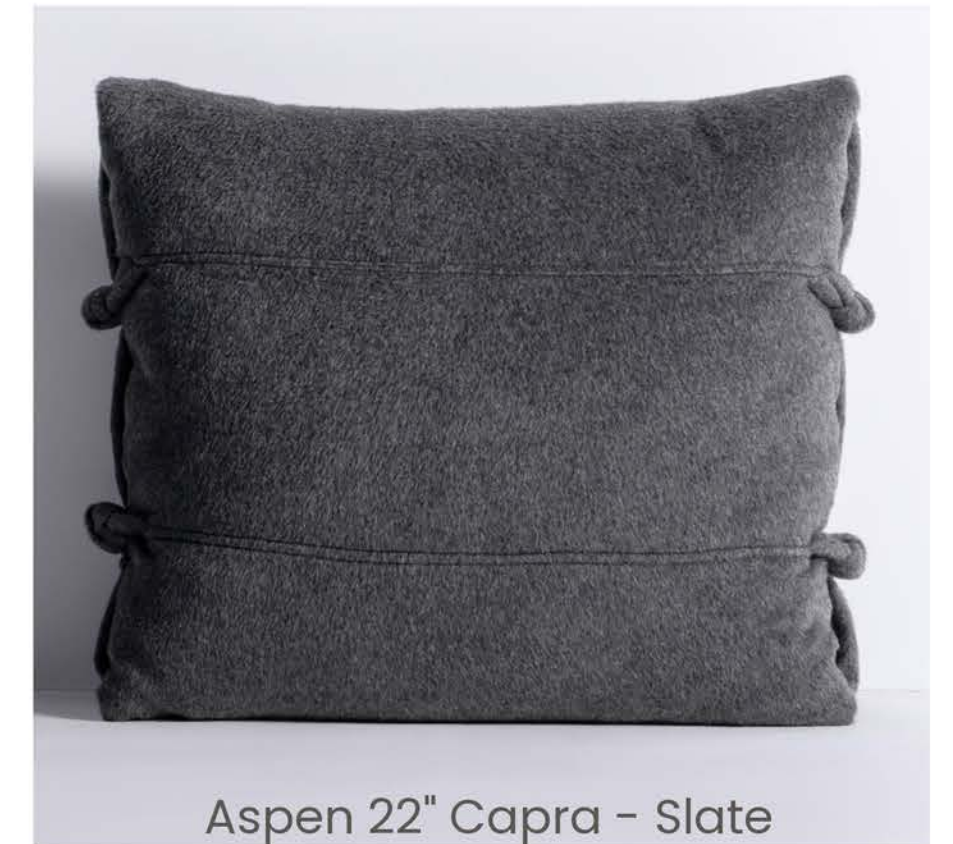
Aspen 22" Capra - Slate