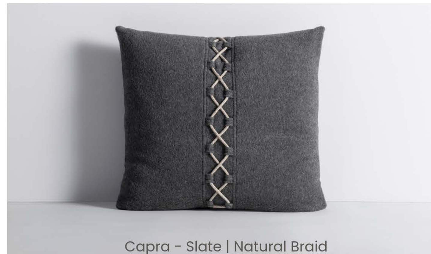
Capra - Slate | Natural Braid