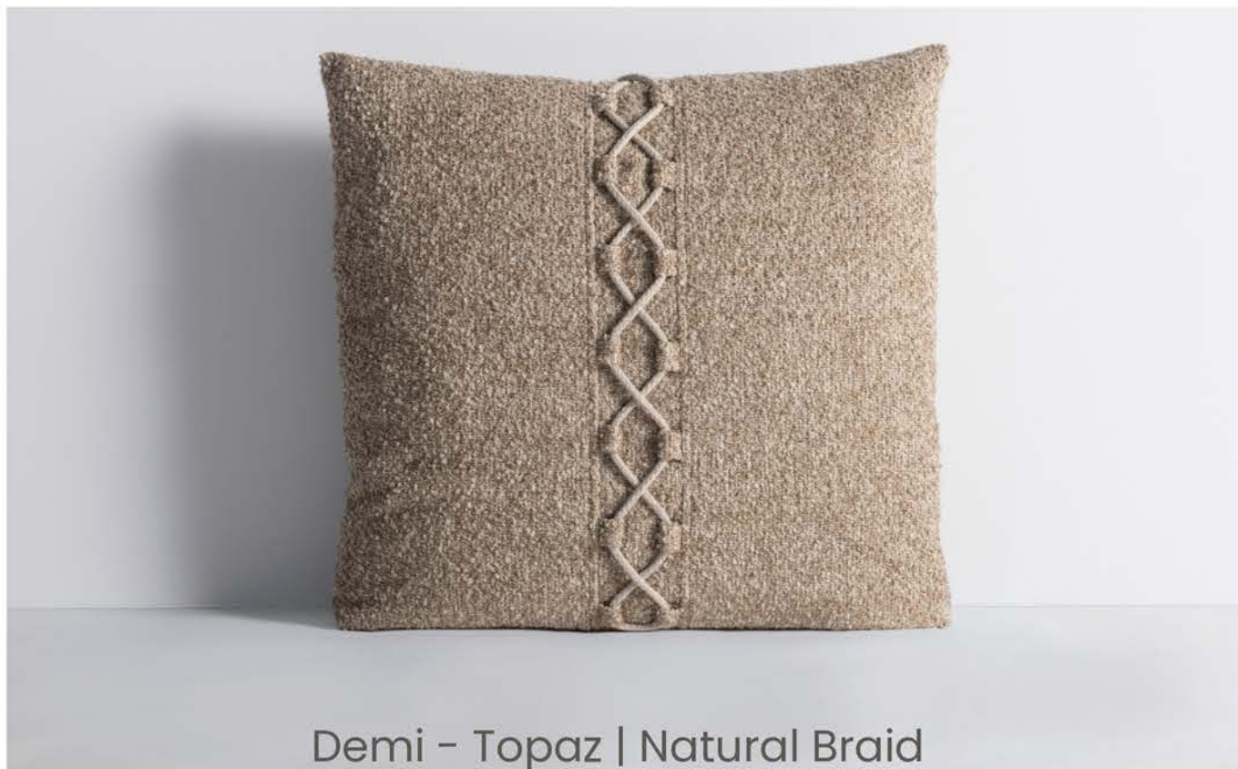
Demi - Topaz | Natural Braid