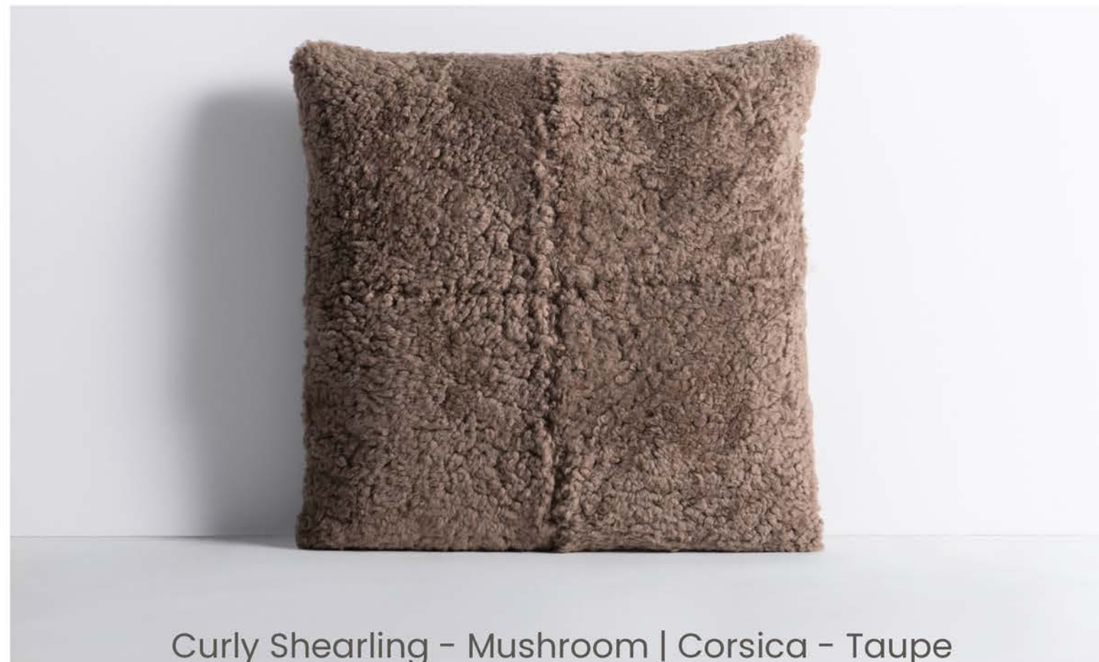
Curly Shearling - Mushroom | Corsica - Taupe