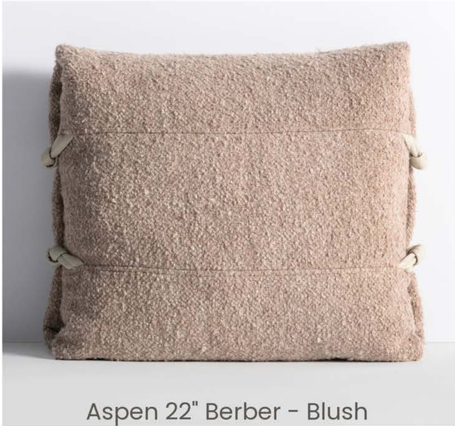
Aspen 22" Berber - Blush