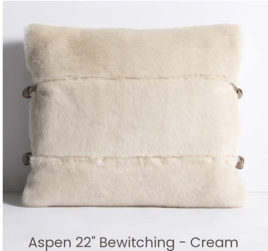
Aspen 22" Bewitching - Cream