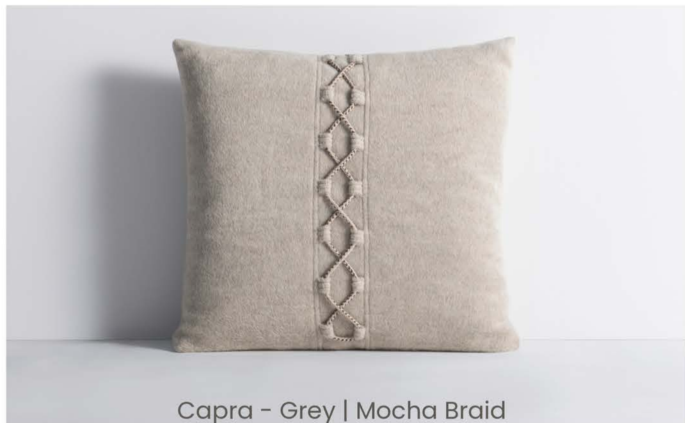
Capra - Grey | Mocha Braid