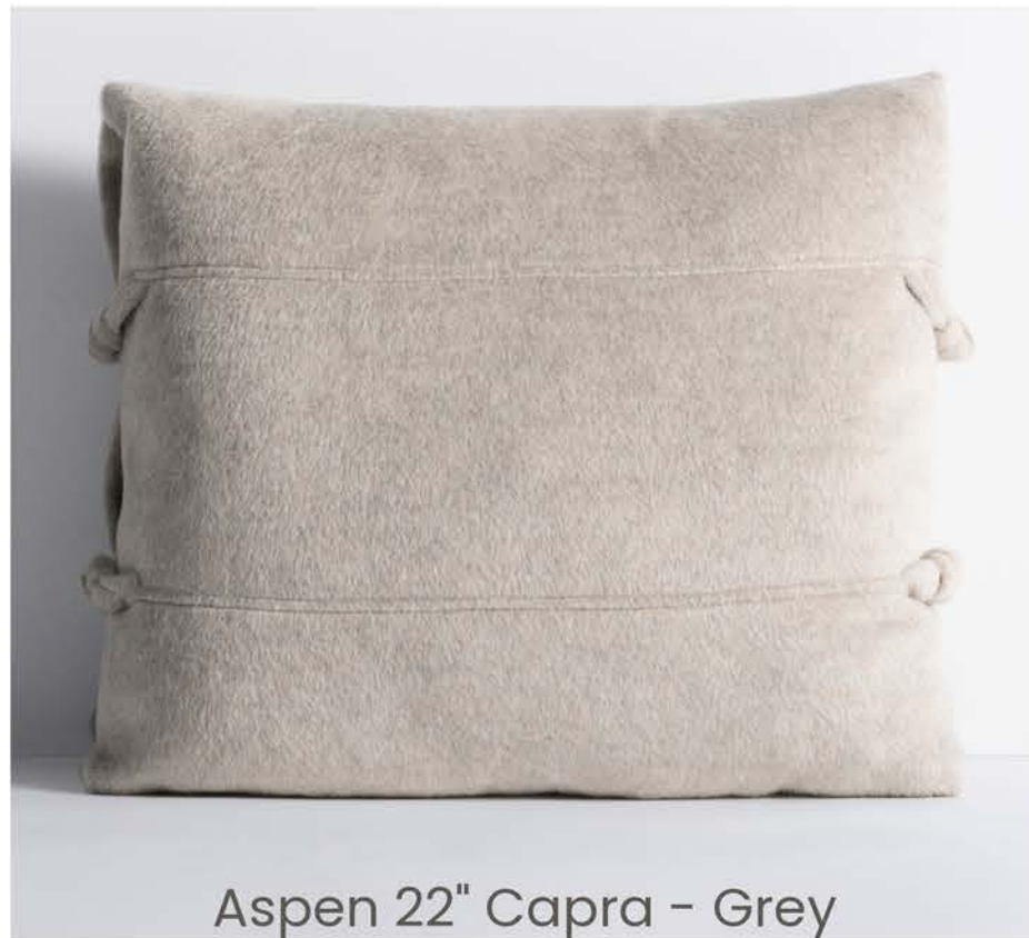
Aspen 22" Capra - Grey