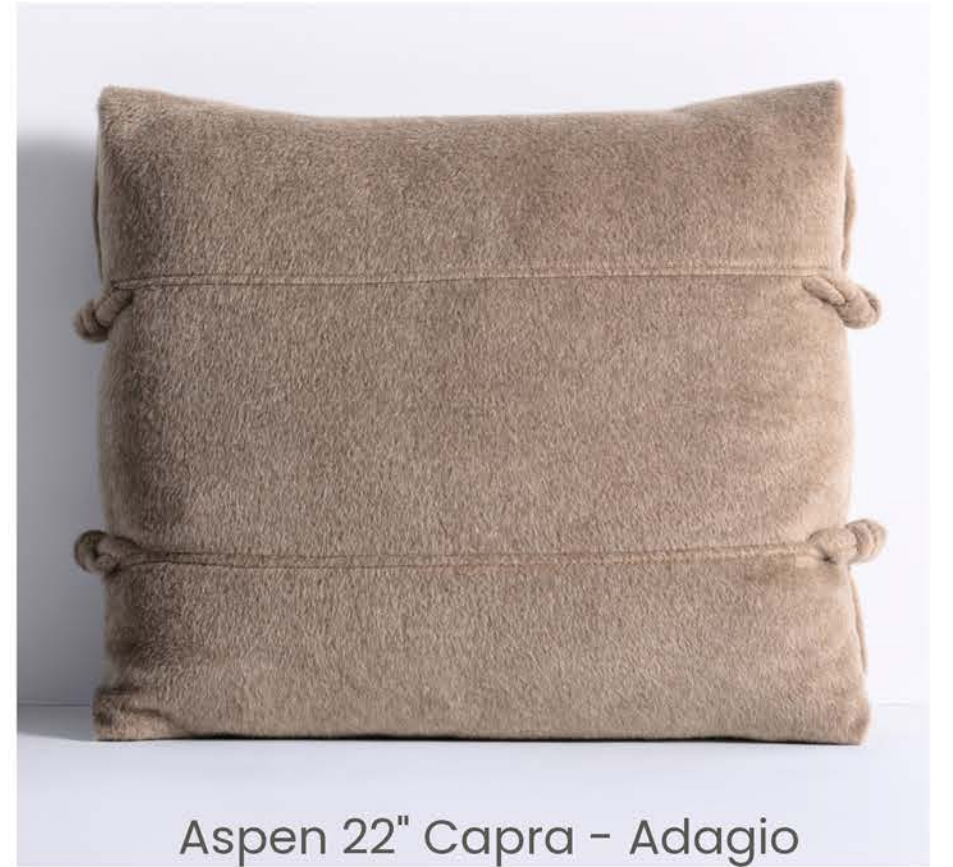
Aspen 22" Capra - Adagio