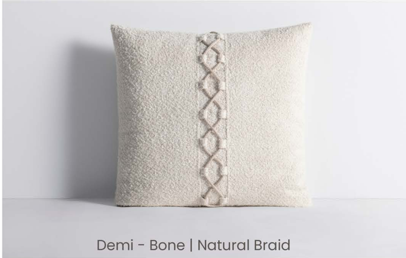
Demi - Bone | Natural Braid