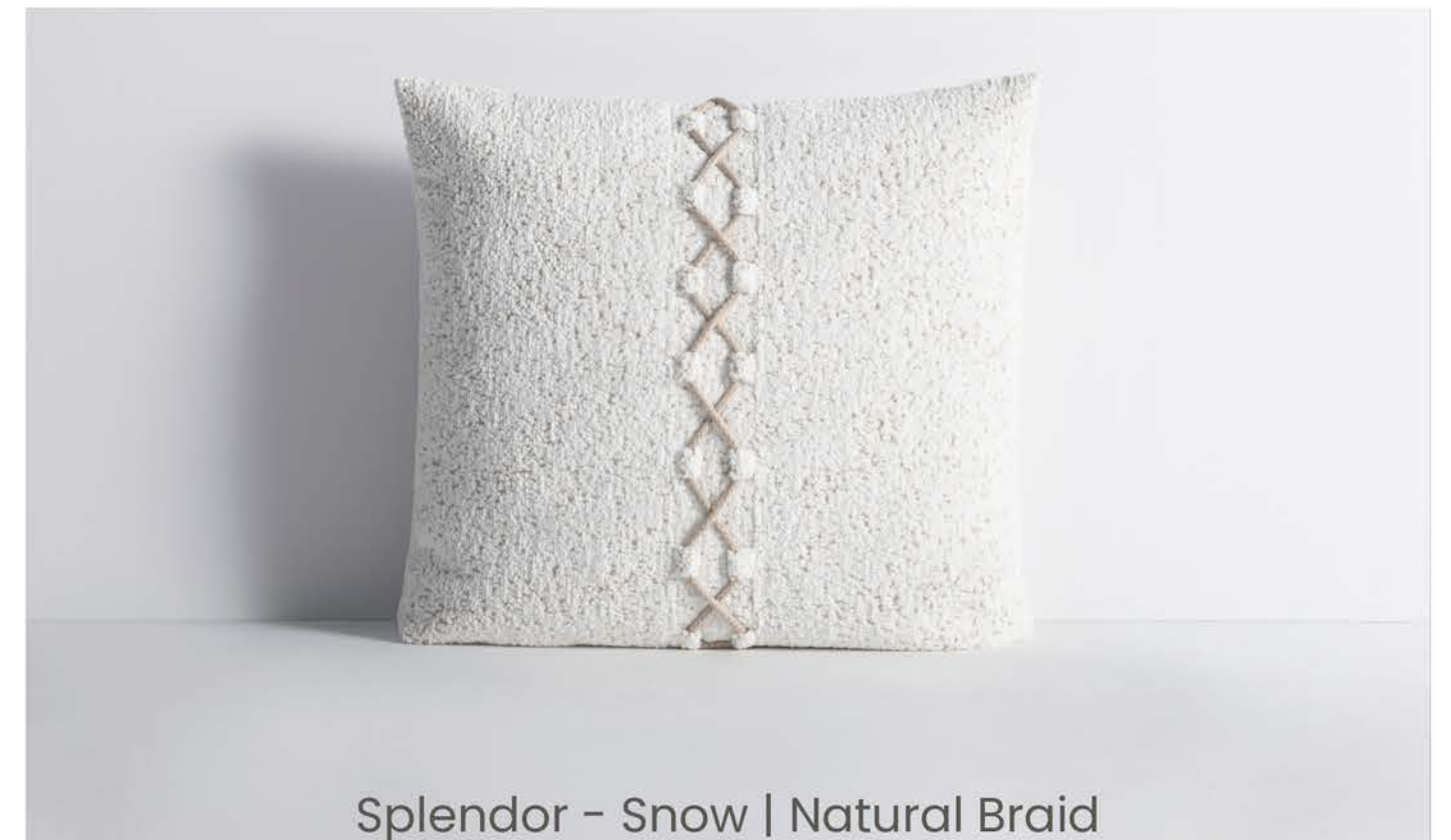
Splendor - Snow | Natural Braid