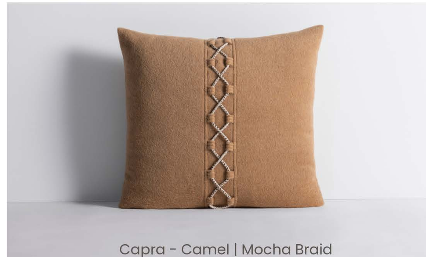
Capra - Camel | Mocha Braid