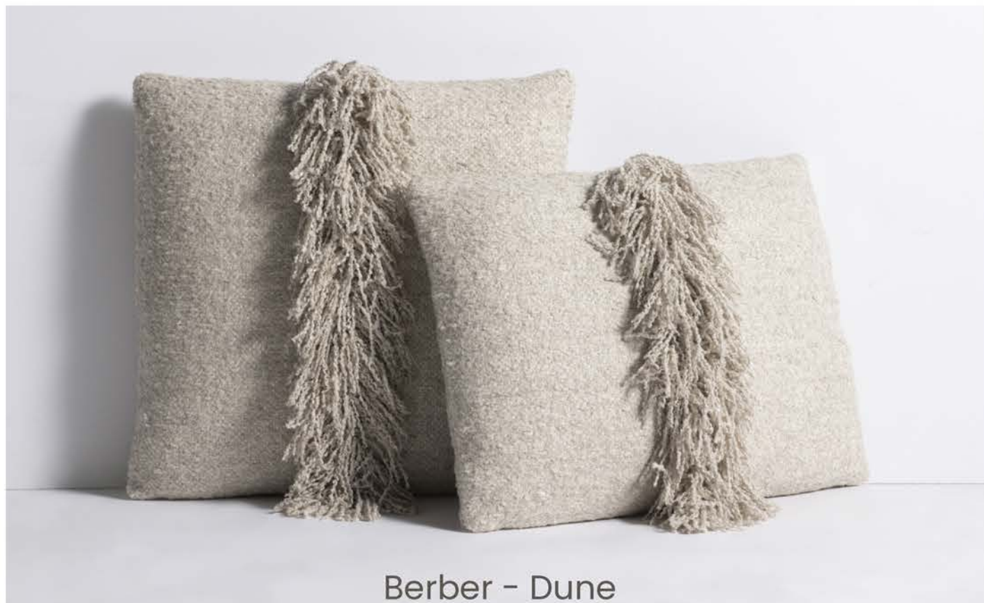
Berber - Dune