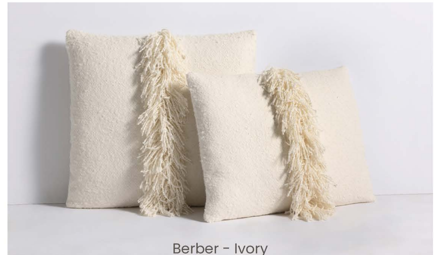
Berber - Ivory