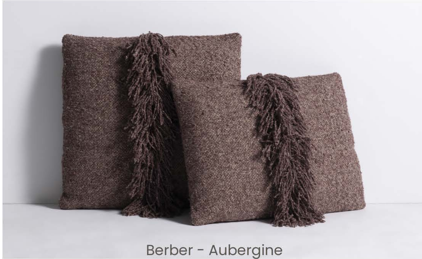
Berber - Aubergine