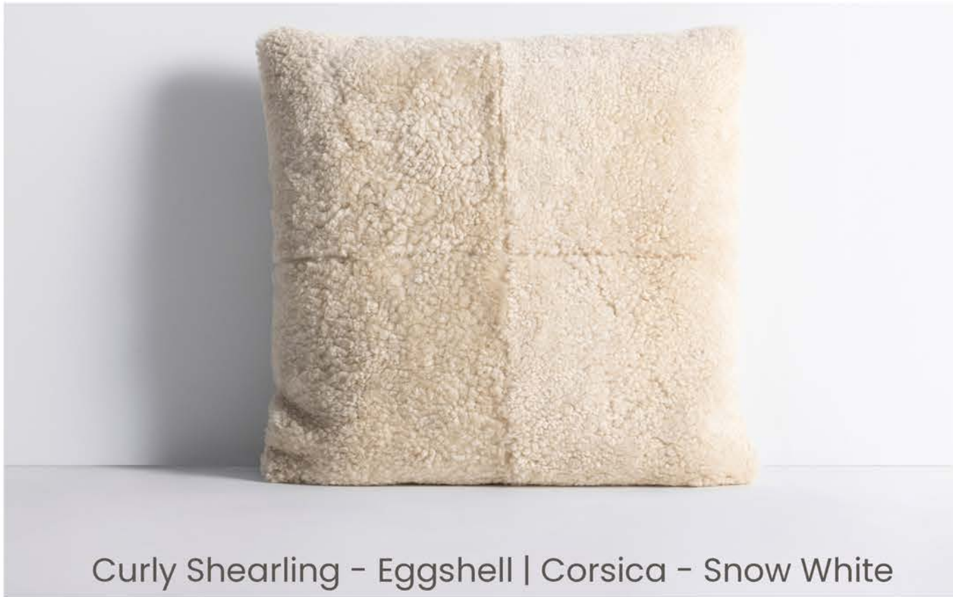
Curly Shearling - Eggshell | Corsica - Snow White