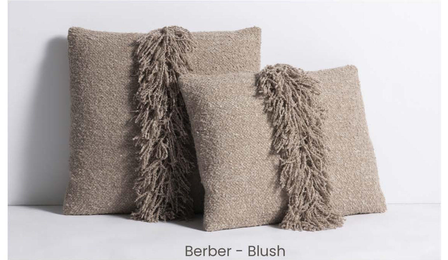
Berber - Blush