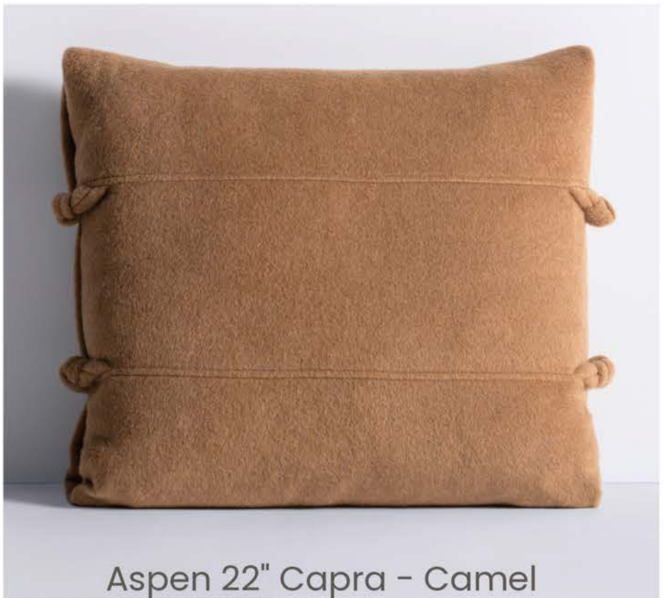
Aspen 22" Capra - Camel